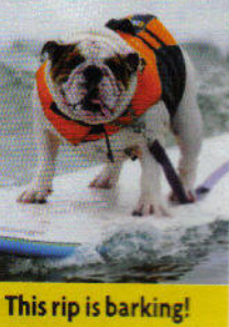
This rip is barking!

It's for a good cause – the event has raised £15,000 for charity