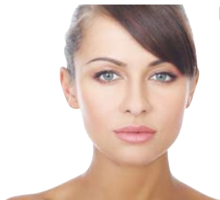
Cover image courtesy of DermaQuest™ Skin Therapy